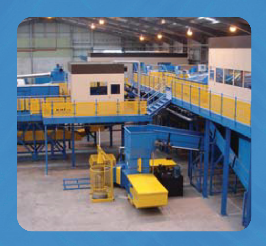
Aries Automatic Baler shown to process card within MRF system.