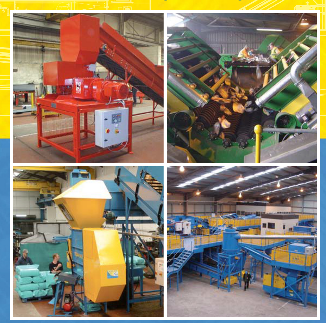
The Complete Solution