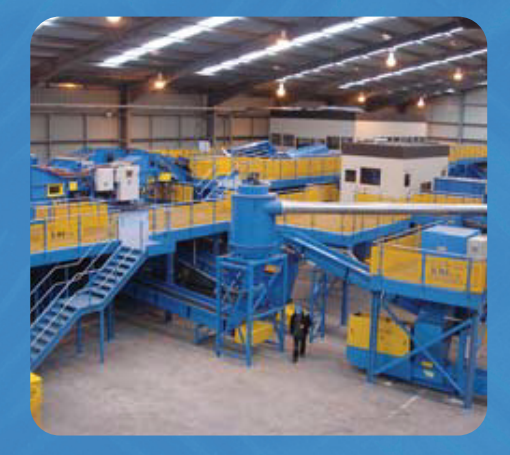
Recent installation 2006, processes 15 tons per hour of dry recyclables including glass.