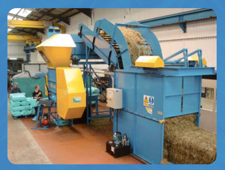
Haylage packing system including bale breaker, weigh conveyor and bagging machine. Finish pack weight 20kg.