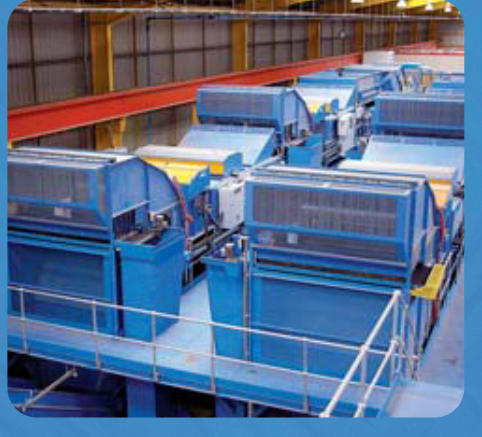
Automatic optical sorting equipment, cleaning up newspaper within MRF system.