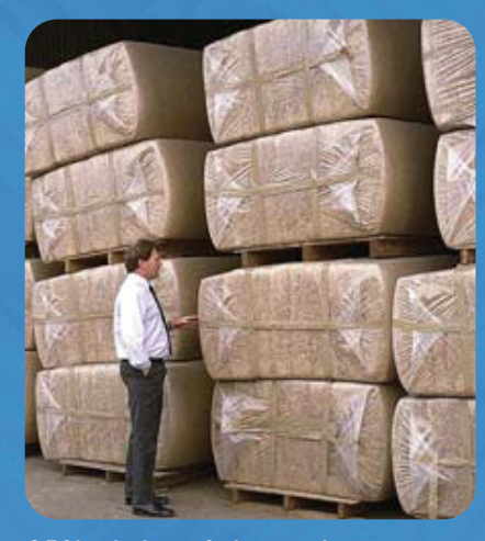
250kg bales of chopped straw shown.