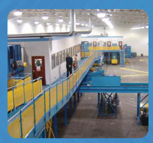
Single line MRF processing 17 tons per hour dry recyclables excluding glass.