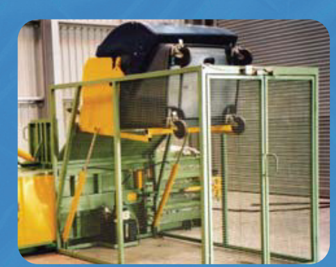
1100 Litre Bin Tipping device with safety cage.