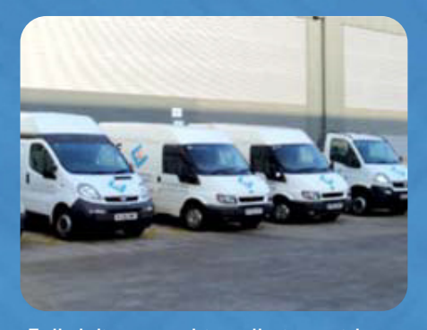
Full delivery and installation with after sales and backup support.