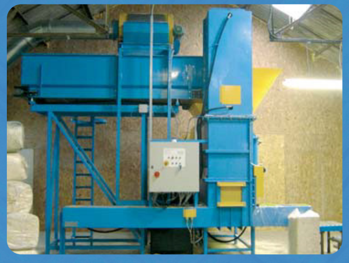
Dust extraction, weight conveyor and bagging plant (20kg).