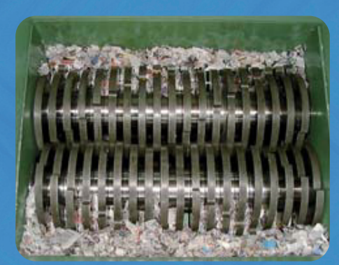
Twin shaft shredders with varying cutter widths and power from 7.5 to 50kw.