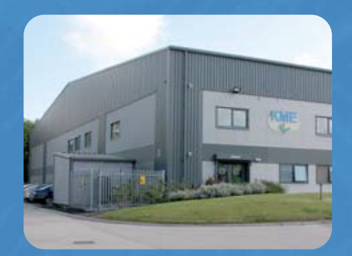
Our new 'state of the art' custom built 42,000sq ft premises.