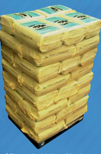
20kg packed bales of haylage.